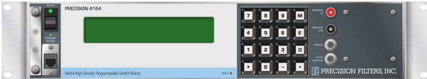
4164 Switch Matrix Front Panel

The control module also monitors the status of the power supply and internal temperature. If a failure is detected, a front-panel FAULT LED is activated.