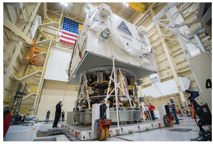
ESA's European Service Module ready for testing in the Space Power Facility

NASA chose Precision Filters' 28000 signal conditioning system for the data system front-end to interface to the spacecraft and facility