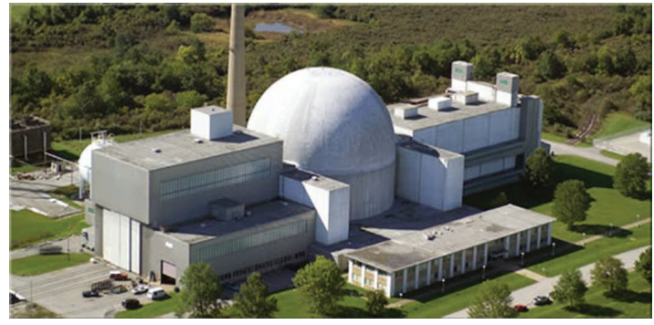
The Space Power Facility at NASA's Plum Brook Station

As humans push farther into our solar system, they need spacecraft proven to withstand the extreme conditions encountered in space. The NASA Plum Brook Station Space Power Facility (SPF) in Sandusky, Ohio, is home to the world's largest and most powerful space environmental simulation test cells. At 100 feet in diameter and 122 feet high, the SPF's Space Simulation Vacuum Chamber is the world's largest space environment thermal vacuum chamber and an ideal site for testing space hardware. The SPF also houses the Reverberant Acoustic Testing Facility, a 101,500 cubic foot chamber that blasts test articles with acoustic sound pressure of up to 163 dB, making it the most powerful spacecraft acoustic test chamber in the world. The threeaxis vibration system of the Mechanical Vibration Test Facility shakes test subjects of up to 75,000 pounds to simulate the vibration that occurs during launch and ascent. In addition, NASA has developed the capability to perform electromagnetic interference/compatibility (EMI/EMC) testing on full-scale spacecraft.